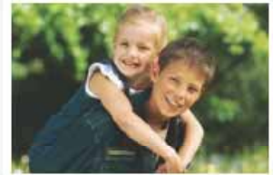
4. little sister