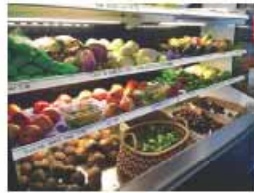
2. grocery shopping