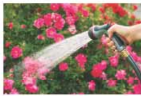
1. outdoor task