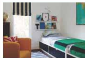
7. neat and tidy