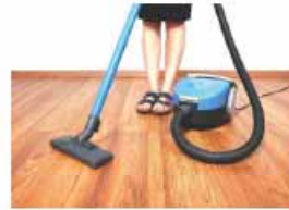
3. household chore