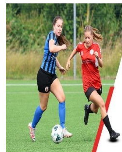
Inter - Milan