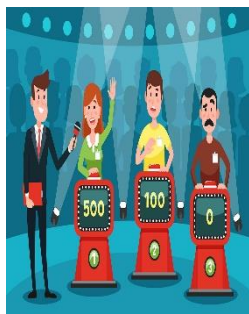
Find the Answer