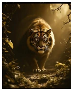
Surviving in Wildlife